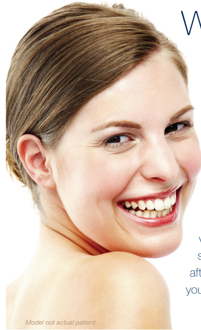
Model not actual patient

Experience minimal downtime in a “lunch-time” treatment and return to your busy lifestyle