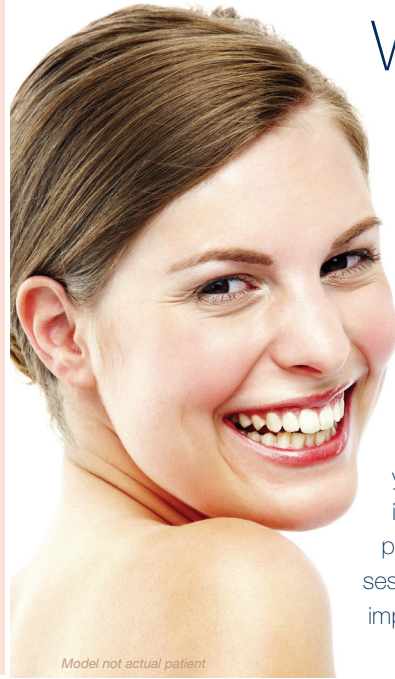
Model not actual patient

Experience minimal downtime in a “lunch-time” treatment and return to your busy lifestyle